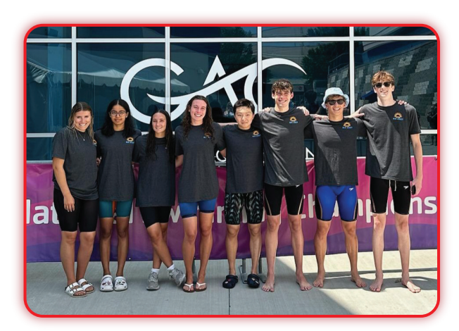
Devilfish swimmers at the 2023 YMCA Long Course National Championships in Greensboro, NC.

The Devilfish Swim Team concluded their long course swim season on a high note this year. Eight Devilfish swimmers earned a spot on the National Team, showcasing their skills at the YMCA Long Course National Championships from July 25–29 at the Greensboro Aquatic Center in Greensboro, NC. Five members of the team alo secured qualifications for the Eastern Zone Long Course Age Group Championships in Richmond, VA.